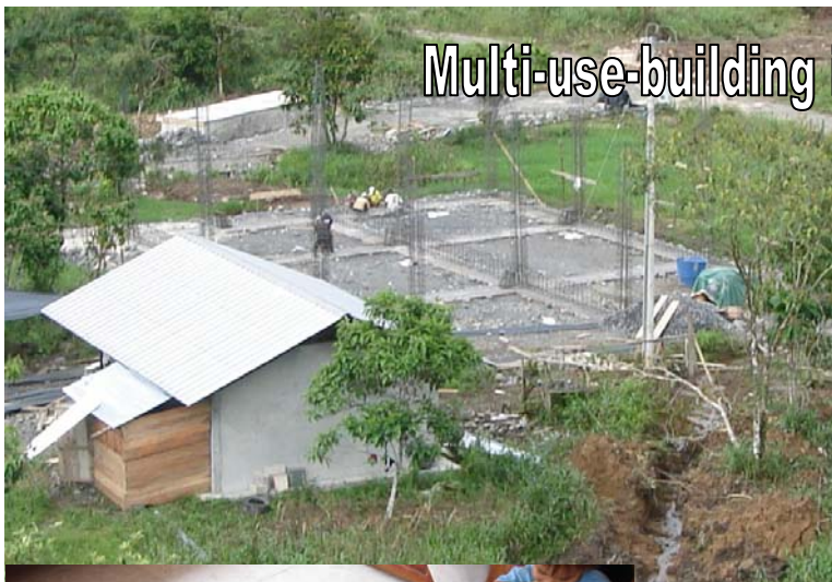
Multi-use-building in progress