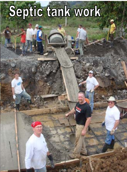
Septic tank work