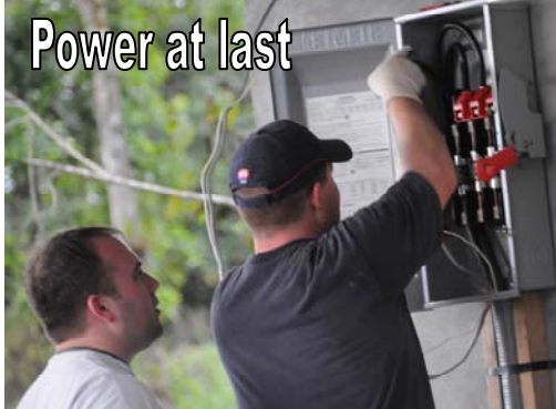
Power at last