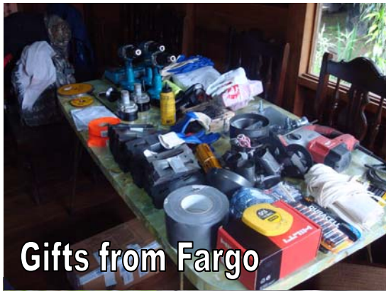
Gifts from Fargo