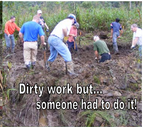
Dirty work but... someone had to do it!